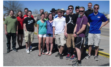
March 2 Canvassing Group